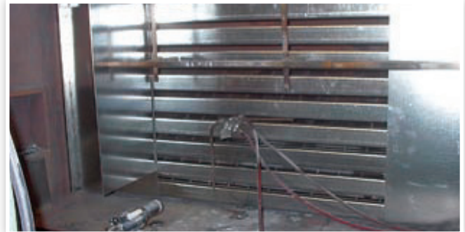
Slotted inlet source capture collection hoods provide uniform exhaust air flow.