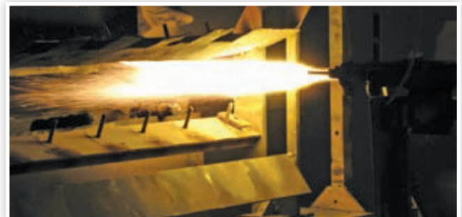
Robotic flame spray booth

"We are also very proud that in taking this step we continue to be a very green operation. Right now, and for several years, we have not had a hazardous waste stream. Everything we do in our operation is recycled."